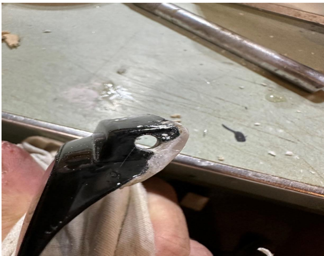
Started sanding down and forming the part.