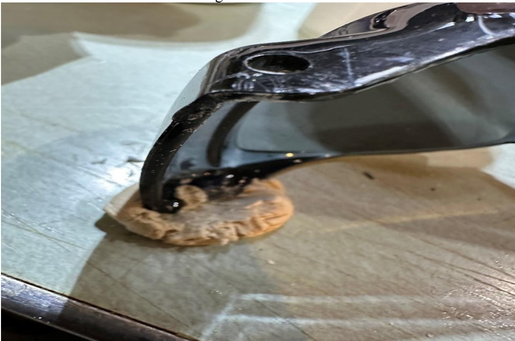
Put super glue on the baking soda. Let dry, add more baking soda and glue to build up the part.