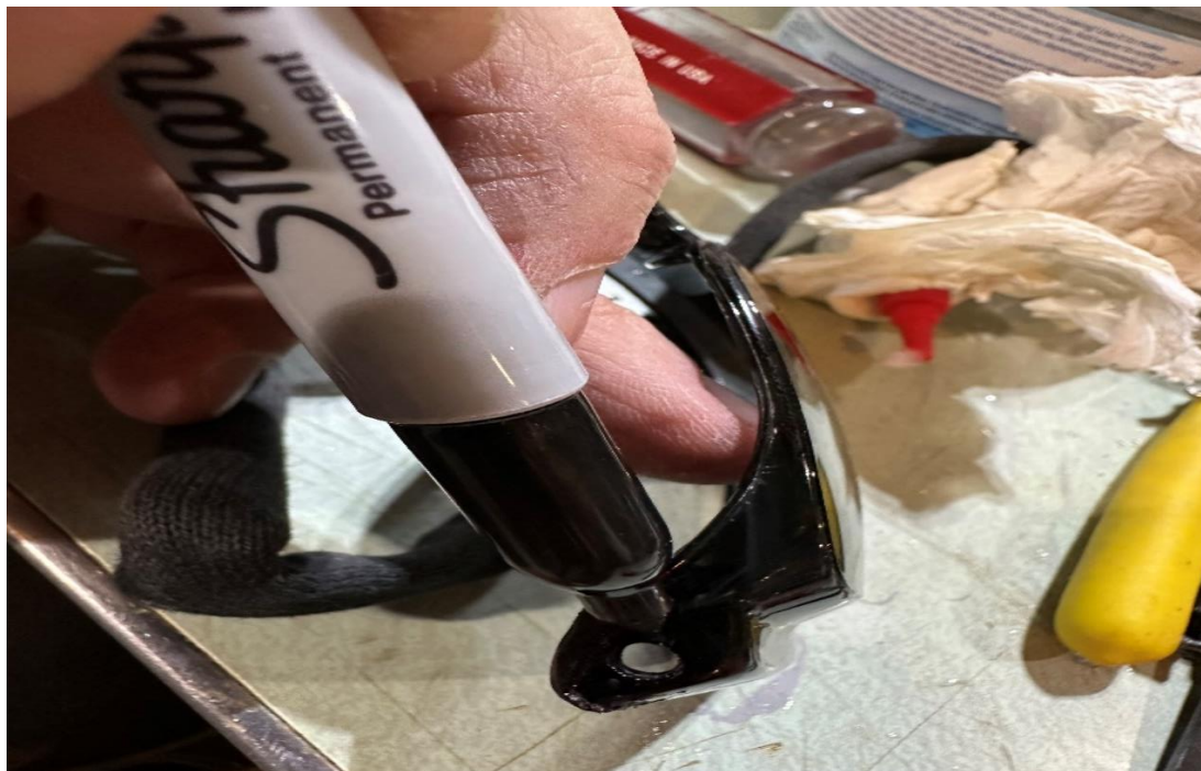
I took a black marker to paint the new built-up piece. Looks GOOD!