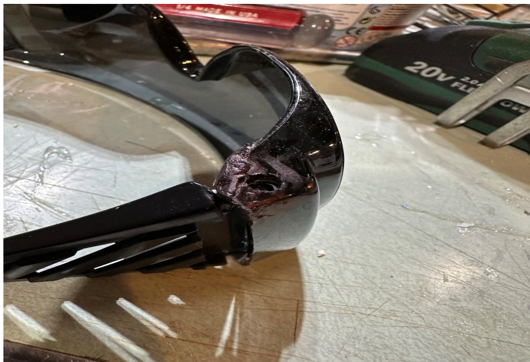
Final result. Looks good and it works! Now I have another pair of sunglasses!