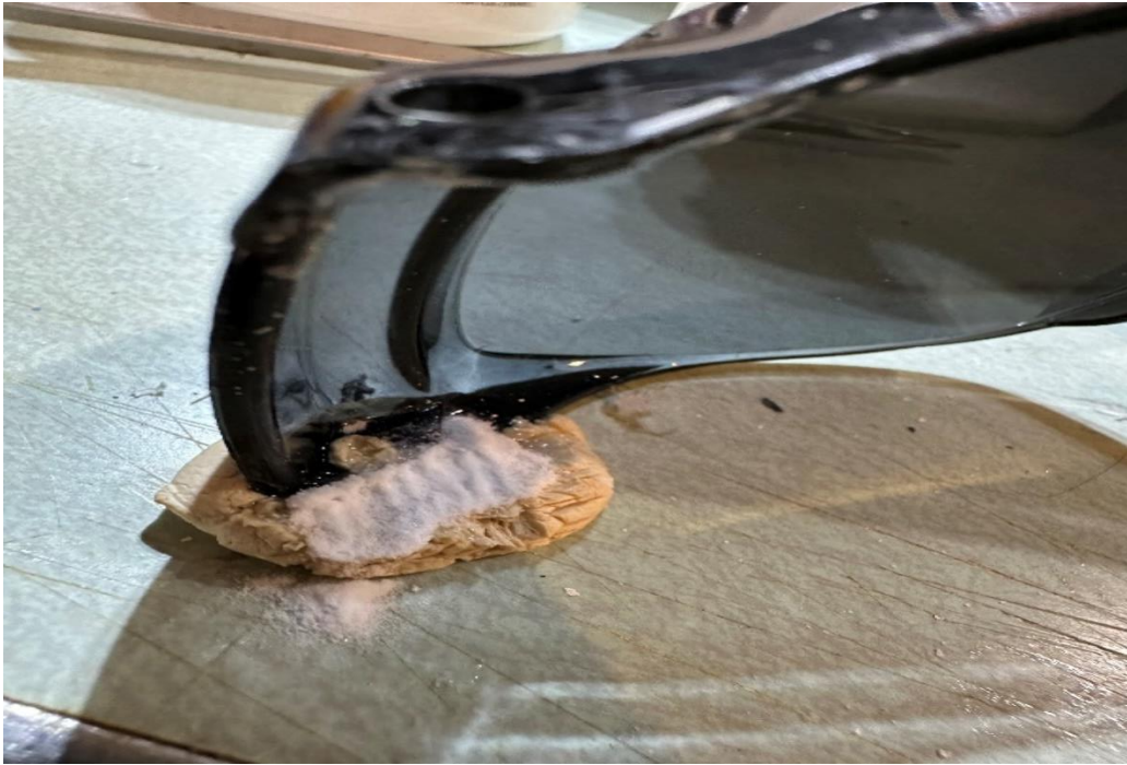
Created the mold and added baking soda.

drill and put a sanding drum on it. I took the drum and sanded down the corner until it was acceptable. In the end it worked! I was amazed.